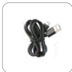
Data cable PC143