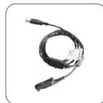
Programming cable PC155