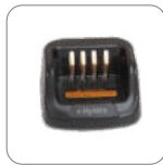
MUC Rapid-rate Charger